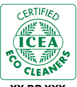
XX DP XXX